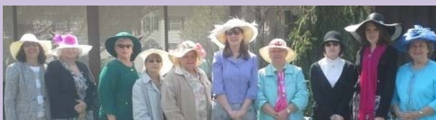
Brave Ladies in their Easter bonnets!