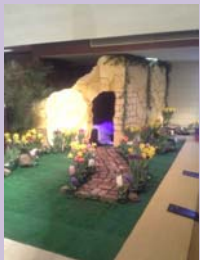
He is Risen!

Love is patient; love is kind. Love is not jealous; is not proud; is not conceited; does not act foolishly; is not selfish; is not easily provoked to anger; keeps no record of wrongs; takes no pleasure in unrighteousness, but rejoices in the truth; love bears all things, believes all things, hopes all things, and endures all things. 1 Corinthians 13:4-7