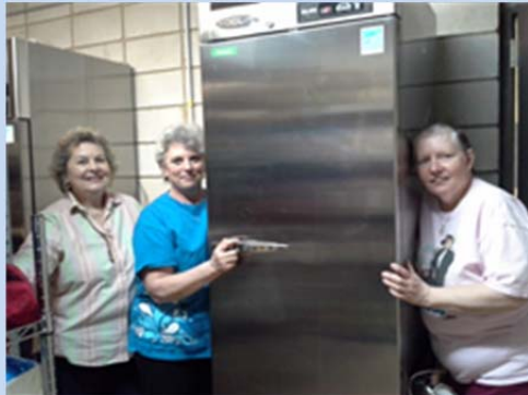
Food Pantry Gets New Refrigerator & Freezer Thanks to Grant.

This wonderful group makes beautiful shawls for adults and babies with love and prayers that are ultimately given to baptism babies, those in the hospital or hospice, or to shut-ins. It's a relaxing and fun fellowship that meets the 2 nd Tuesday of each month.