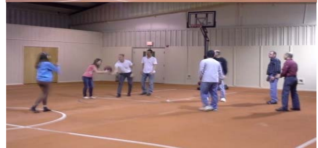
Working off a delicious ham dinner while some watched the game.