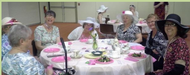
A fun Formal Tea & Fashion Show by UMW.